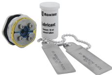
C RS T Ex seal

For detailed information, please visit roxtec.com .